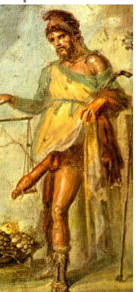
Priapus, god of luck, weighing his organ against a bag of gold (Pompeii)

Marulla each time weighs in hand the penis, erected at full stand, and tells the pounds and ounces of the gland. † Its work now done, she grabs the male member, weighs it—rag-like, frail— 5 and states how lighter, in detail. That's no hand: it's a weighing-scale. arrectum quotiens Marulla penem pensavit digitis diuque mensa est, libras, scripula sextulasque dicit; idem post opus et suas palaestras loro cum similis iacet remisso. 5 quanto sit levior Marulla dicit. non ergo est manus ista, sed statera. + The Latin says libra (3/4 of a pound), scripula (1/288th of a libra!, here plural), sextula (one sixth of an ounce)