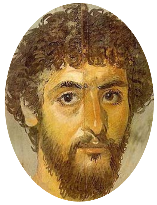
No image of Martial exists. This will have to do.